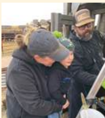
Tregen has a heifer calf and Krease has a bull calf for next year.