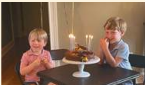
Birthday party - celebrating 3 and 5 years old.