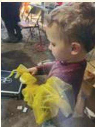
Tregen is ready for hire if any customers need any preg checking!