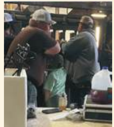
Our goal is to raise some freeze branders!