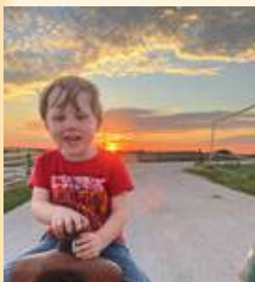
Doesn't get any better than this!