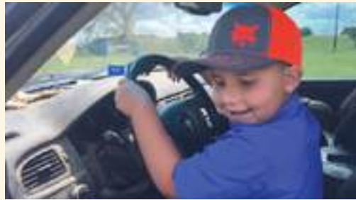
His very first time to drive all by himself!