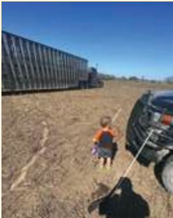
Getting ready to load grass cattle and from past experience, nobody wants to get to close to the armed kid!

Please be sure and check out the bull videos and comments on mccabegenetics.com . We will continue to add to them daily and should have them all online by one week before the sale. Be sure to turn on the volume to get a real time appraisal of the bulls.