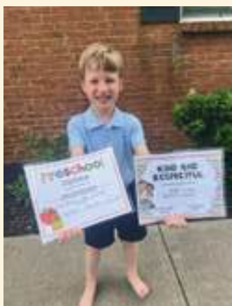
Diploma and Kind and Respectful Award